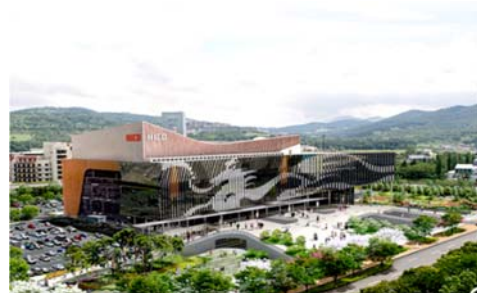
Night view of Gyeongju and HICO